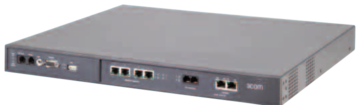
Standards-based 3Com V3001 Analog platforms offer a comprehensive set of features, all in a compact form factor for particularly cost-effective and practical deployment.

SIP support unlocks access to advanced software that optimizes the productivity-enhancing benefits of VoIP technology and facilitates employee communications with collaborative tools such as IP Messaging and IP Conferencing applications.