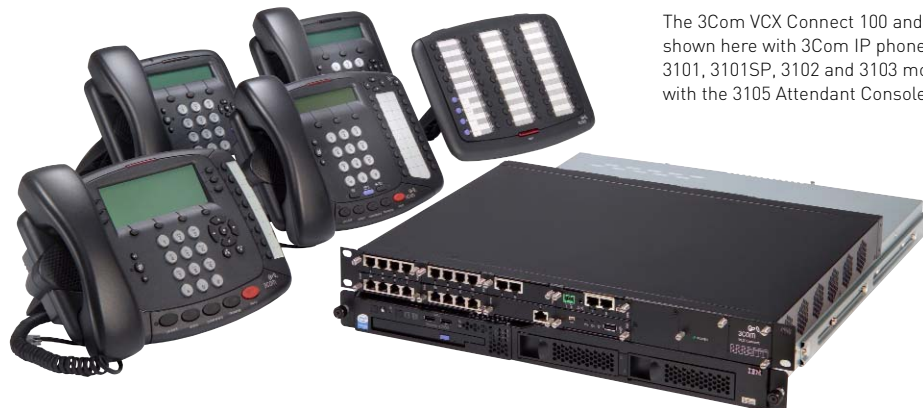
The 3Com VCX Connect 100 and 200 platform are shown here with 3Com IP phones, including the 3101, 3101SP, 3102 and 3103 models, as well as with the 3105 Attendant Console.